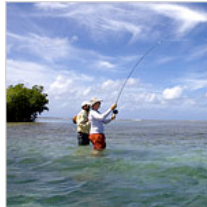
Fishing in Vieques