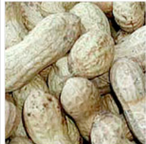
Warner: Mean Grown-Ups