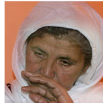
Defying a Clan Code of Silence